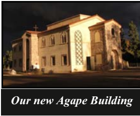
Our new Agape Building

Our Festival is a way to share our Greek Culture and Heritage with friends from all over Southern California. Our Christian Faith is the inspiration behind the food and fun. We are a Greek (Eastern) Orthodox parish, part of the oldest Christian tradition, dating to 33 A.D. We trace our roots back to the Apostles and their teachings. We hold fast to the moral, theological, and liturgical traditions of the Early Christian Church. The Orthodox Church is the second largest Christian church, with 300 million followers.